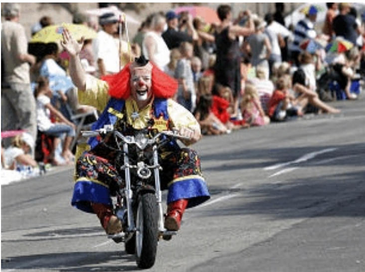
Howdy the Clown rides in the Days of '47 Parade in Salt Lake City Friday.

http://extras.sltrib.com/tribphoto/Gallery.asp?ID=140680&PubDate=2009-08-02&GID=DAYS%5F07242009